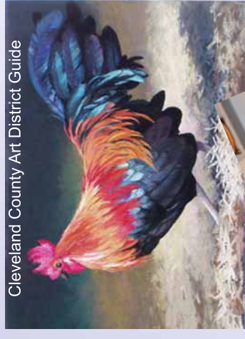
Cleveland County Art District Guide

Let us show you... what we've got to crow about